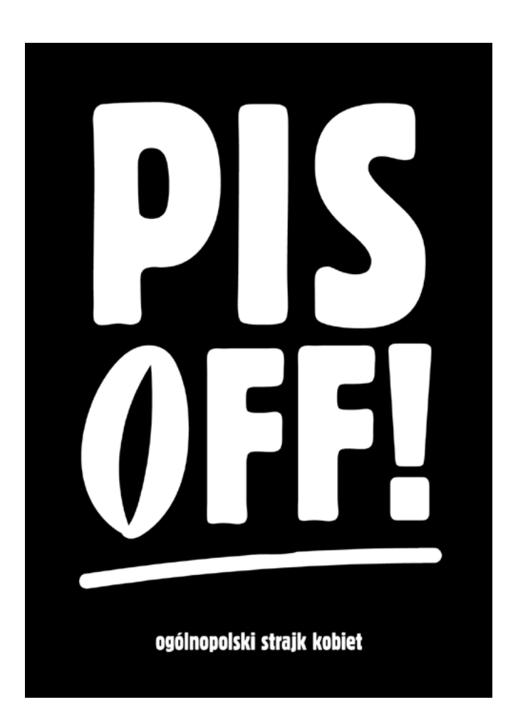
Figure 2. M for Graphic Emergency Service: PIS OFF!, 2016