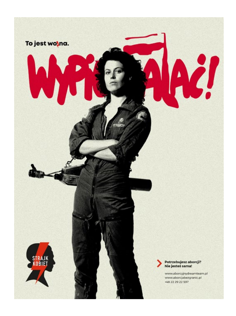
Figure 3. Jarek Kubicki for All-Polish Women's Strike: WYPIERDALAĆ!/FUCK OFF! To jest wojna/This Is War, 2020

Kill Bill neo-Western martial arts film, or Imperator Furiosa from George Miller's 2015 post-apocalyptic action movie Mad Max: Fury Road. Ripley for instance, a fictional war captain and strong heroine played by the American actress Sigourney Weaver, is one of the first and most significant female action protagonists in cinematic history and a prominent figure in popular culture. Kubicki presents her wearing military fatigues, armed with a weapon hanging over her shoulder, strong-willed and ready to fight. An additional text in the upper-left corner of the poster reads To jest wojna (This is war), accompanied in its lower part by the contact details for Abortion Without Borders and the characteristic OSK logo—a black silhouette portrait of a woman with a red lightning bolt in the middle.