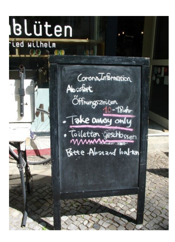
Figure 1: Information about takeout in front of a Japanese restaurant in early May, 2020

Many restaurants, regardless of whether they offered takeout or delivery services, created vouchers for customers to use after lockdown. Some were created individually by the respective restaurants and others via the community website Helfen.Berlin, for example. Vouchers ranged from EUR 10 to EUR 100 and could be purchased in restaurants or online. This strategy worked very well for some restaurants, and their owners stressed how impressed they were with the community solidarity. But the level of solidarity seemed to differ depending on the neighborhood in which the restaurants were located. Although regulars did come back after the shutdown and bought vouchers to support the Japanese restaurants of all the owners whom we interviewed, the culture of community support seemed to be