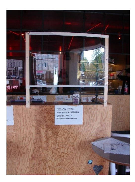
Figures 4 and 5: Measures taken in and outside of restaurants to protect customers and staff from COVID-19 (photographs by the author, May 2020 in Berlin)

were large signs displaying the hygiene rules: wear facemasks, maintain distance and sanitize and wash one's hands. When I was allowed to enter, I was asked to sanitize my hands with sanitizer provided from an installation that looked like a Japanese shrine. I had to wear my facemask until I was seated. Before placing my order, I was asked to enter my contact information into a form that asked for my email address, home address, phone number and relationship to the people accompanying me. When I received my food, I was asked to take it from the tray myself so that the waitress did not have to touch it. Soy sauce and other condiments that were usually provided freely on the table were missing and came with the food in small plastic packages instead. Free, self-serve tea refills were also impossible due to the hygiene restrictions. I could, however, order tea directly from the staff.