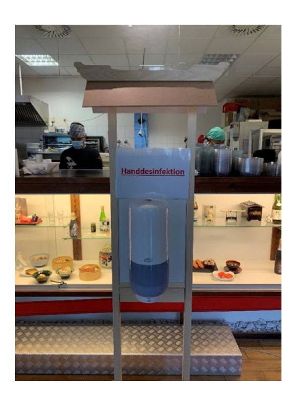
Figure 3: Sanitizer provided from an installation that looked like a Japanese shrine in a Japanese restaurant (photograph by Agata Olszewska, May 2020 in Berlin)

My first visit after reopening for indoor dining in mid-May to a Japanese restaurant that I had used to frequent often was very different from previous experiences. Even though I had made a reservation, I had to wait outside the restaurant until I was asked to enter. There