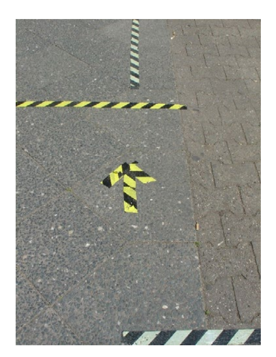
Figures 6 and 7: Tape mark spots for customers to line up in front of restaurants (photographs by the author, May 2020 in Berlin)

to protect staff and customers from each other in the weeks before. With time, takeout services in restaurants increased and protection measures became more elaborate, including for example preparing counters to minimize contact between staff and takeout customers. Some restaurants distributed takeout food from windows; others even cut holes into their windows to create even smaller contact zones (figure 4). Some restaurants allowed takeout customers into their restaurants in May but created counters with protective measures (figure 5). In addition, restaurants regulated waiting lines and minimum distances for those waiting by putting marks on the sidewalk (figures 6 and 7).